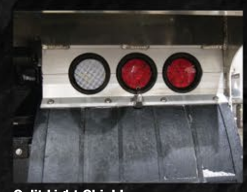
Split Light Shield