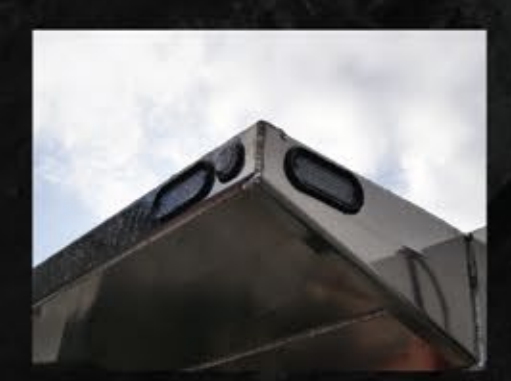
Strobe Lights in Cab Shield