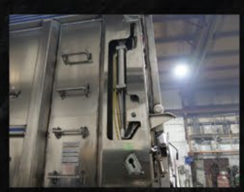
Mechanical Ground Control