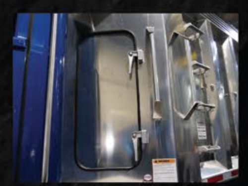
45 Degree Man Door