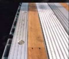
Chain Sleeve Tie Down