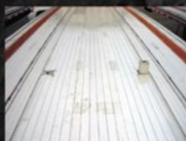
Coil Well with Deck Pockets