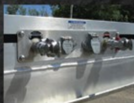
Removable Access Panel