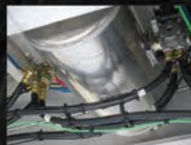
Aluminum 12" Jumbo Air Tanks