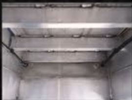
MAC's Integrally Superior Welded Design