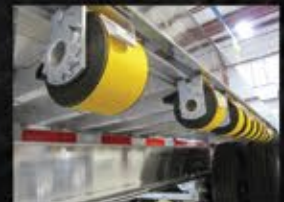
Galvanized sliding winch option