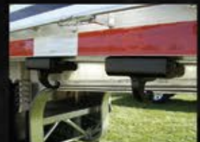
Slide Strap Hooks