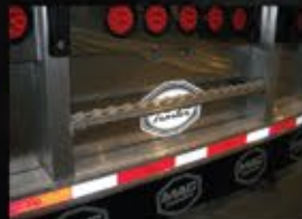
Bumper-Center Section Full Width Step