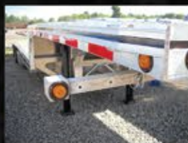
Wide Load Retractable Lights - Full Extension