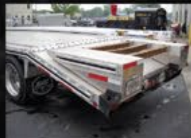
Beaver Tail with Flip Ramp and Deck Boards