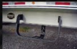
Tire Carrier Option