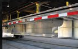
Dunnage Box-Side Mount