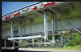
Belly Mount Panel Storage Rack

(D) - Specific to Drop Deck Trailers (F) - Specific to Flatbed Trailers