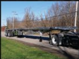
Single Axle Slider moved to Cal. Legal