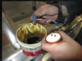
Extra Di-Electric Grease Added