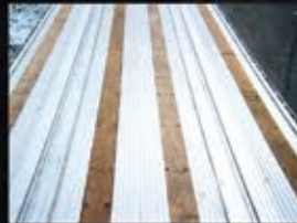
Drop Deck with Four Nailers