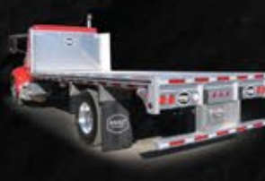
Straight Truck Bed Available