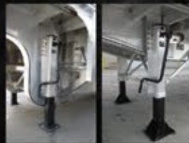
JOST AX150 Aluminum Outer Leg Landing Gear