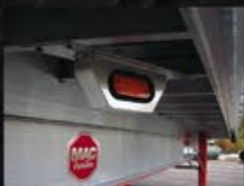
Enclosed Midturn Light Option