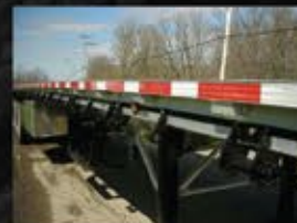
Western Side Rail with Fixed Angle Winches and Fixed Strap Hooks