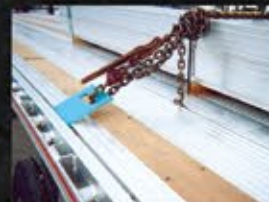
Sliding J-Hook Tie Down