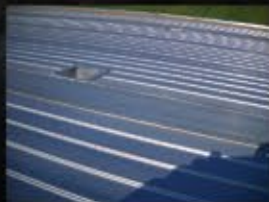
Deck Slitter Pockets