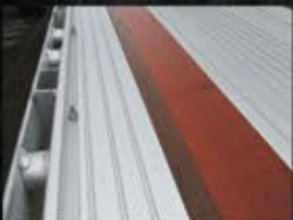
Double Entry J-track with Double Spools