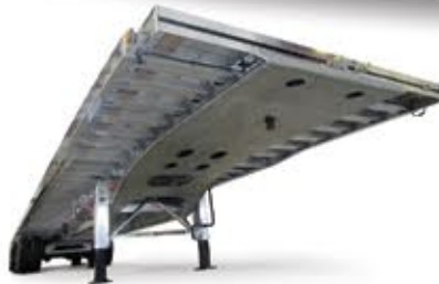
MLP-6 1/2" Aluminum Coupler Plate extending through the neck transition.