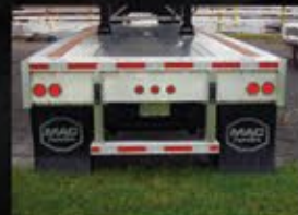
ICC Bumper 48" Length and Under