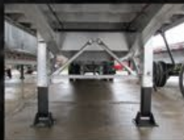
Flatbed Landing Gear K-bracing