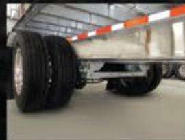
AANL-230 w/ 250 air bags & Hendrickson HXL-5 sealed Wheel End Sys. (5-yr. Warranty) Galv. suspension hangers & brace.