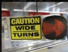
Wide Turn directional arrow on each side