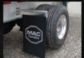
Frame Bolt Mount Flap Bracket