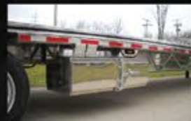
60" Double Door Toolbox with Stainless Steel Camlock