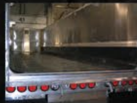
Stainless or Plastic Liners