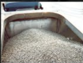
Large Radius Gussets on Bulkhead