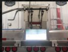
Replaceable Coal Door