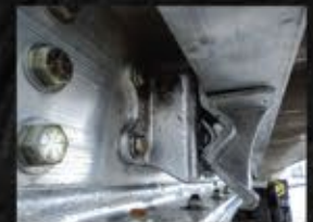
Spring Loaded Body Hold Down