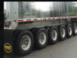
Multiple Axle Configurations