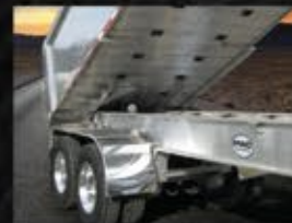
Aluminum Panel Floor