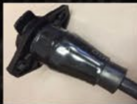
Sealed 7-Way Harness