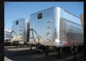
Radius Front Bulkhead