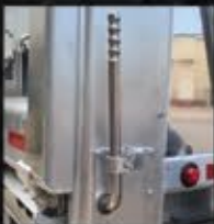
Manual Gate Ground Control