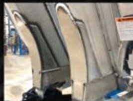
Front Doghouse Cap-offs