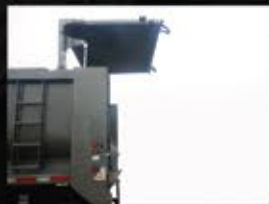
High Lift Gate