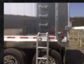
Ladders and Steps